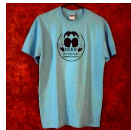
Kids Clothes Gift #17 A and 17B

For more orphans to get access to education DOF needs to build an education center so that more orphans can be helped. With a generous gift of $100,000 you make it possible for DOF to build a beautiful Education Center just like the one featured here.