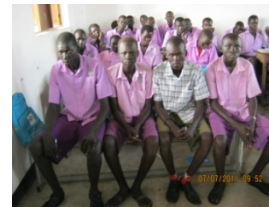
DOF Students on Waiting List. Gift #13

Students study under the tree. Gift # 12 In South Sudan students still do their studies under a tree. It is worst for orphans who have no one sending them to good school. You can help change this situation With a gift of $262 each from four (4) individuals one of these orphans can go to good school for whole year.