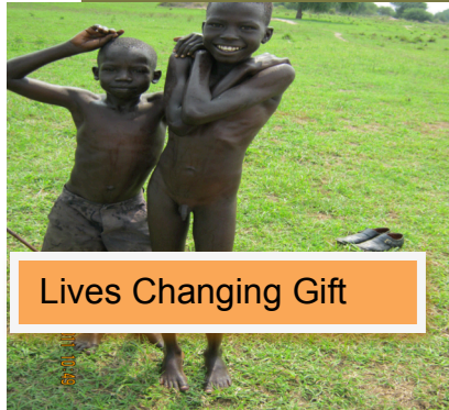
Lives Changing Gift

This is for orphans living in the country where buying computer is like buying a house. These kids have heard of technology but have no mean to access that technology. You can let them taste the technology. For $300 you can buy good laptop for an orphan child on our program