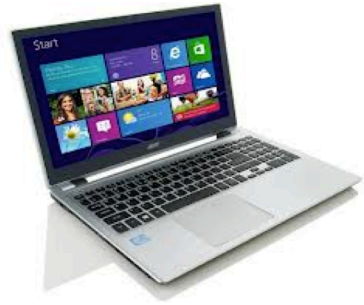
Laptop for Student. Gift #11